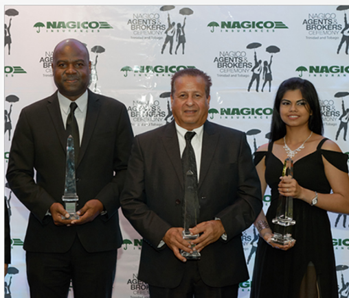
Diamond Producers from left, Hardath General Insurance Consultants Limited, Agostini Insurance Brokers Limited, Personalized Insurance & Reinsurance Ltd and Universal Insurance Brokers Limited