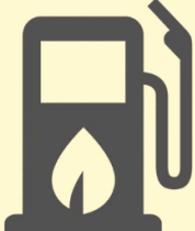
FUEL FOR GENERATOR