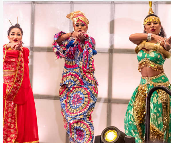
The renowned Shiv Shakti dancers performing a choreographed dance depicting the theme of Resilience